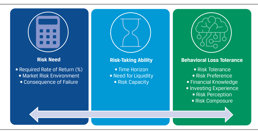
FIGURE 1. IRP FACTORS AND RELATED ELEMENTS

Conceptually, the elements comprising an IRP can be grouped according to three factors. As shown in Figure 1, these factors are (1) risk need, (2) risk-taking ability, and (3) behavioral loss tolerance.